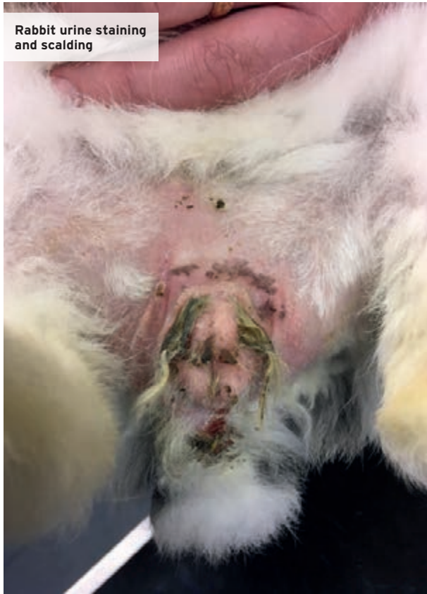
Rabbit urine staining and scalding