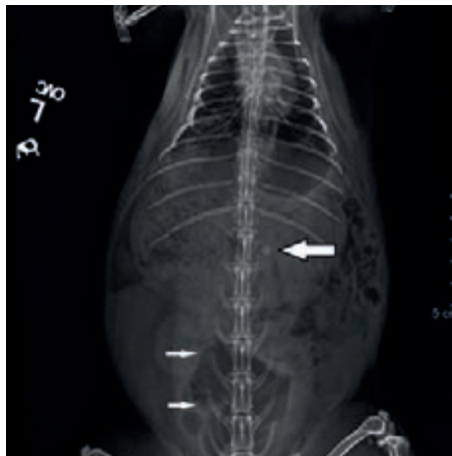
X-ray 1, with arrows pointing to stones in kidney and ureter

The urine may be chalky and gritty in appearance, often quite dark yellow and may contain blood. As sludgy urine may be harder to express and painful, some rabbits may therefore display discomfort on urinating, or have urine staining or even urine scalding on the legs where the urine is not expressed appropriately.