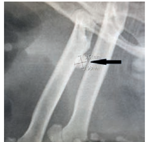
X-ray 2, with arrow pointing to calculi measuring 3.91x3.98mm