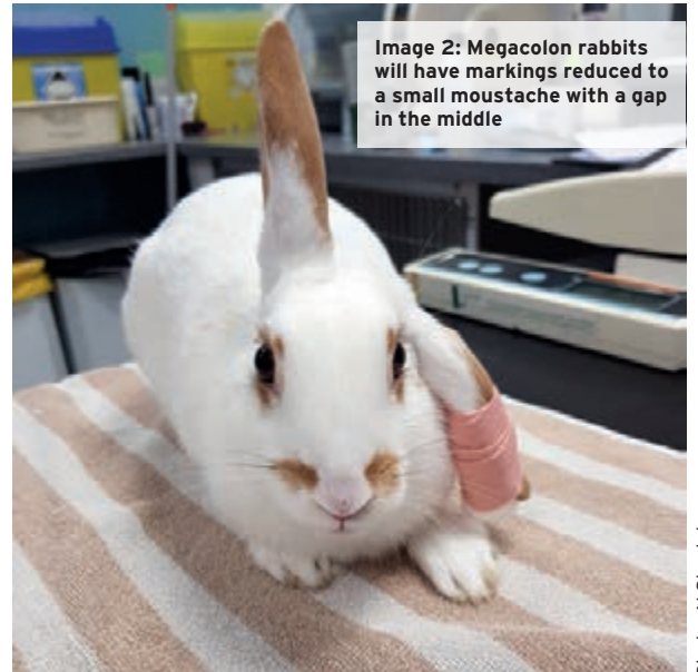
Image 2: Megacolon rabbits will have markings reduced to a small moustache with a gap in the middle

Megacolon rabbits can appear healthy but have intermittent episodes of pain. They are constantly hungry because they have difficulty absorbing nutrients and need to eat more than a normal rabbit. They develop a prominent spine and ribs (referred to as a loss of body condition). They will have a large abdomen because the peristaltic movement (the waves of