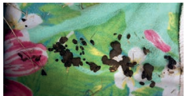
Image 6: Their faeces are extremely variable, ranging from very large faecal pellets through to copious pasty diarrhoea

Breeding two English rabbits together should be avoided to prevent offspring suffering from megacolon syndrome.