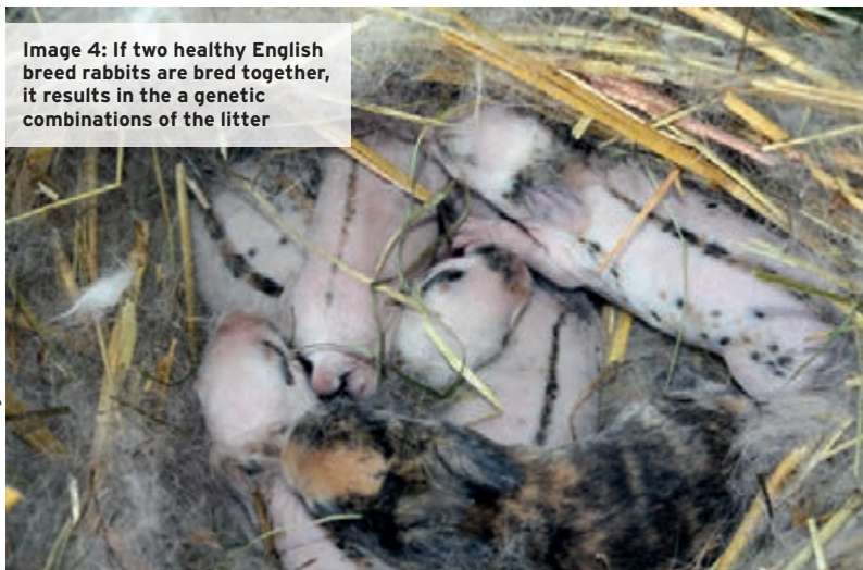
Image 4: If two healthy English breed rabbits are bred together, it results in the a genetic combinations of the litter

Day-to-day management of these rabbits will be dramatically different from what is required during a crisis.